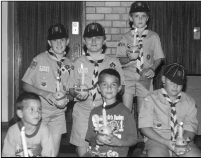
CHRISTINGLE 1ST NEWTON PARK CUBS AND FRIENDS

Those who dallied after the Christingle were in for a real treat; they were invited to attend a rehearsal of the Protea Place of Safety Christmas Pageant. When we said our good byes, all were filled with the true spirit and peace of the Christmas Season.